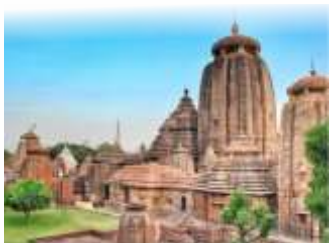
Jagatpur, Odisha 24th Sep 2024