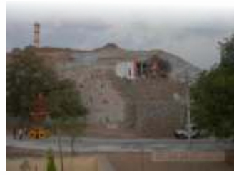
Mundagi, Karnataka 6th Aug 2024