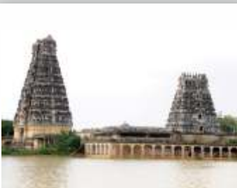
Ariyalur, Tamil Nadu 9th Sep 2024