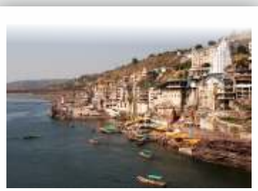
Bhatpachlana, Madhya Pradesh 18th Sep 2024