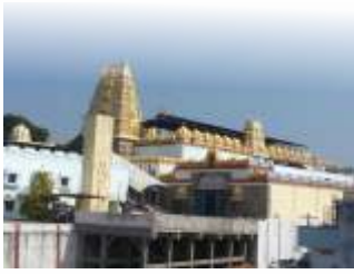
Thallada,, Andhra Pradesh 29th July 2024.