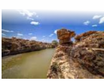
Giddaluru, Andhra Pradesh 23rd Aug 2024.