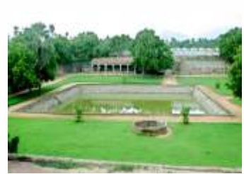
Anjugramam, Tamil Nadu 19th Aug 2024