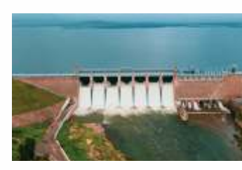
Andipatti, Tamil Nadu 22nd Oct 2024