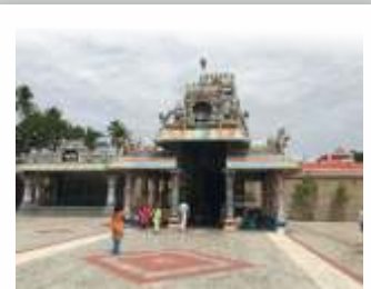
Aravakurichi, Tamil Nadu 4th July 2024.a