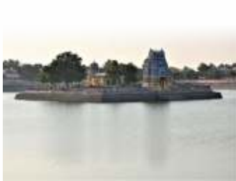
Peravurani, Tamil Nadu 19th Aug 2024