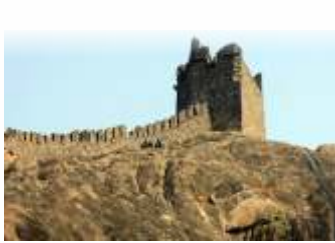
Gurajala, Andhra Pradesh 7th Oct 2024