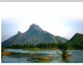
Sankarapuram, Tamil Nadu 9th Sep 2024